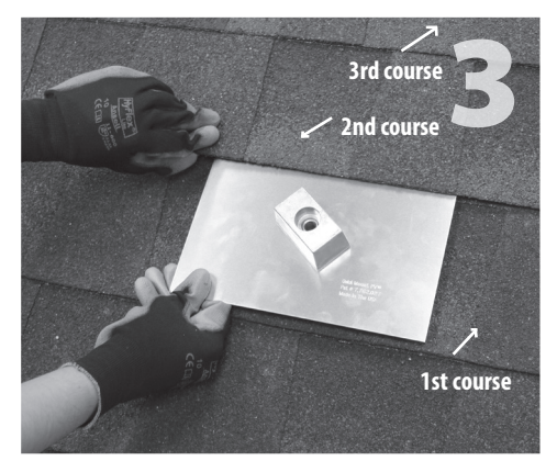
Insert flashing between 1st and 2nd course. Slide up so top edge of flashing is at least 3/4" higher than the drip edge of the 3rd course and lower flashing edge is above the drip edge of 1st course. Mark center for drilling.