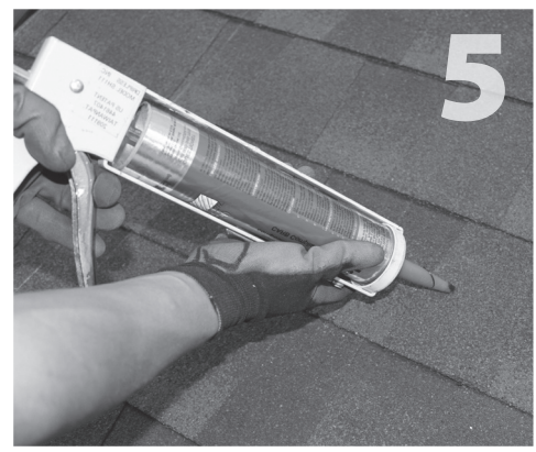
Clean off any sawdust, and fill hole with sealant compatible with roofing materials.