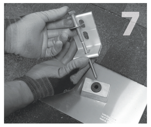
Slide the washer and the L-foot (not included) onto the lag screw.