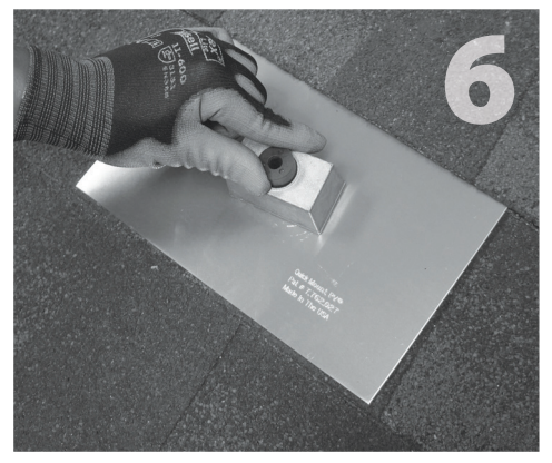
Slide the flashing into position. Insert the rubber plug into the QBlock cavity.