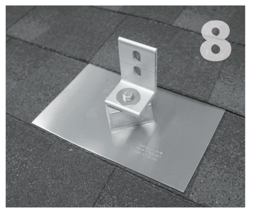
Using a 1/2 inch socket on an impact gun drive the lag screw until the QBlock stops rotating easily. DO NOT over-torque.

You are now ready for the rack of your choice. Follow all the directions of the rack manufacturer as well as the module manufacturer.