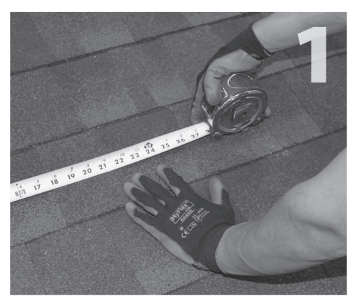
Locate, choose, and mark centers of rafters to be mounted. Select the courses of shingles where mounts will be placed.