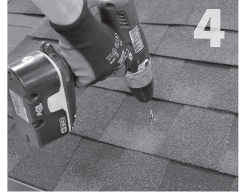
Using drill with 7/32" bit, drill pilot hole into roof and rafter, taking care to drill square to the roof. Do not use mount as a drill guide. Drill should be 'long style bit', aka 'aircraft extension bit' to drill a 1\frac{3}{4} " deep hole into rafter.