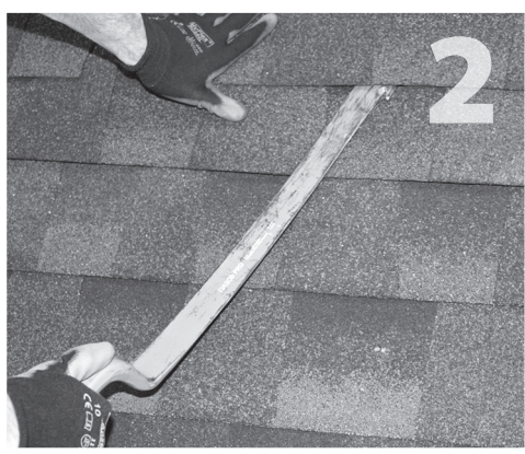
Carefully lift composition roof shingle with roofing bar, just above placement of mount. Remove nails as required. See "Proper Flashing Placement" on next page.